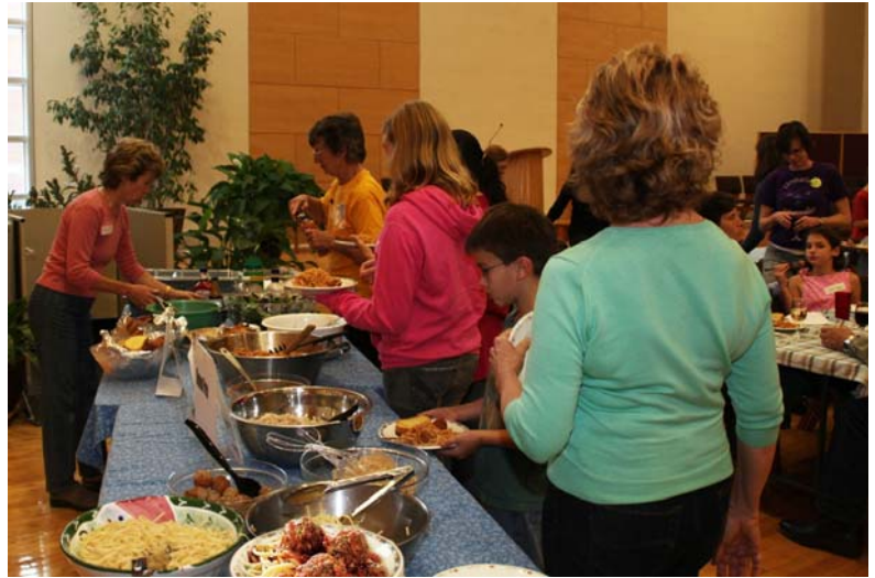
Lots of pasta! Food and fun were had by many at the pasta dinner sponsored by the Religious Education Council on October 1.